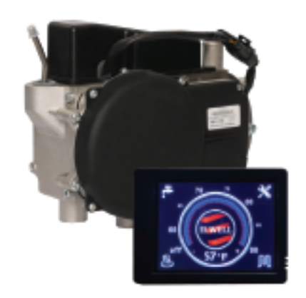
Clean & Efficient